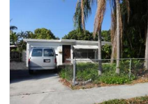
195 NE 20th Street

MLS#: R10322508 Status: CS Price: $145,000 SqFt: 950 Beds: 2 Bath: 1 (1 0)