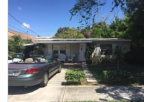
161 NE 15th Ter

MLS#: R10369593 Status: A Price: $285,000 SqFt: 1,396 Beds: 2 Bath: 1.1 (1 1)