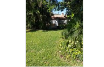
199 NW 9th Street

MLS#: R10320945 Status: CS Price: $275,000 SqFt: 1,636 Beds: 2 Bath: 2 (2 0)