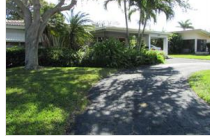
480 NE 26 Terrace

MLS#: R10308350 Status: CS Price: $270,000 SqFt: 2,103 Beds: 3 Bath: 2 (2 0)