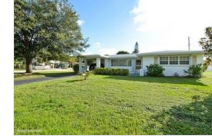
2798 NE 4th Dr

MLS#: R10318136 Status: CS Price: $287,500 SqFt: 1,867 Beds: 2 Bath: 2 (2 0)