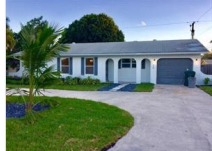
268 NW 12th St

MLS#: F10084489 Status: CS Price: $352,000 SqFt: Beds: 3 Bath: 2 (2 0)