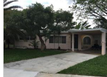
300 NE 23rd Street

MLS#: R10339719 Status: A Price: $390,500 SqFt: 1,952 Beds: 3 Bath: 2 (2 0)