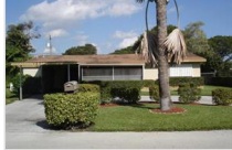
137 NW 7th Street

MLS#: R10288434 Status: CS Price: $265,000 SqFt: 1,292 Beds: 2 Bath: 2 (2 0)