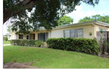
2333 NE 4th Av

MLS#: R10335725 Status: CS Price: $245,000 SqFt: 2,139 Beds: 3 Bath: 2 (2 0)