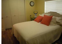
585 NW 2nd Avenue

MLS#: R10282500 Status: CS Price: $375,000 SqFt: 1,180 Beds: 3 Bath: 2 (2 0)