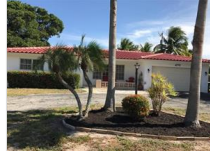
470 NE 28th St

MLS#: F10073500 Status: CS Price: $395,000 SqFt: Beds: 3 Bath: 2 (2 0)