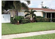
2131 NE 4th Avenue

MLS#: F10092583 Status: A Price: $269,000 SqFt: Beds: 2 Bath: 1 (1 0)