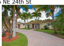
365 NE 24th St

MLS#: R10306282 Status: CS Price: $385,000 SqFt: 1,672 Beds: 2 Bath: 2 (2 0)