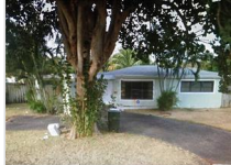
155 NE 20th St

MLS#: R10371926 Status: A Price: $449,999 SqFt: 1,890 Beds: 3 Bath: 2 (2 0)